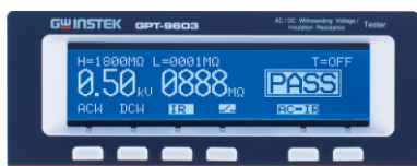
Large LCD, High Intensity Indicators and Function Keys

The 240 x 48 display clearly shows the applied voltage, test parameters, test conditions, measurement value and result on the screen at the same time. The real-time status update on the LCD display accompanied by the multi-colored LED status indicators on the front panel allow operators to have a full control of the test process to perform precession test and avoid unnecessary operation risks at the same time. The status indicator above the high voltage output terminal will automatically flash when an output is in place. In addition, the function keys arranged below the LCD display provide convenient operation that test functions can be easily changed by a single pressing.