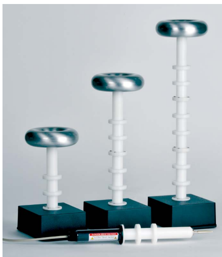
HVL Series High Performance Lab Grade, HV-SmartProbes™ shown above in 35KV, 70KV and 100KV models. Handheld HVP-35 portable HV-SmartProbes™ shown with detachable probe tip.

Vitrek's 4700 precisely measures voltages directly up to 10KV, right out of the box—with no external probes. That's high enough for most of the HV sources out there. However, should you care to expand your high voltage measurement range—just add one or more of the available 35KV, 70KV, 100KV and 150KV SmartProbes™. The Vitrek SmartProbes™ each store their own calibration data which is down loaded when they are plugged in to the 4700—this results in high accuracy, calibrated readings and allows any Vitrek SmartProbe™ to be used with any 4700 HV Meter. The SmartProbe's™ proprietary, ultra-low TC attenuator design minimizes self-heating—while its low capacitance technology enhances AC