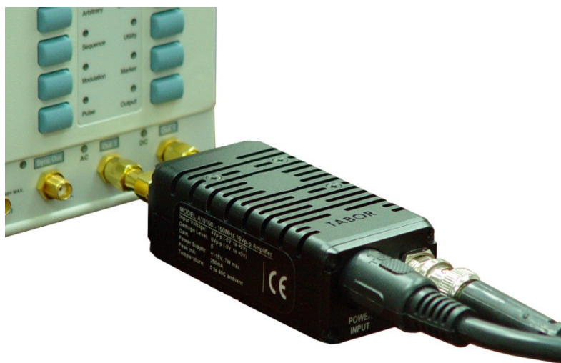
Figure 2, Connecting the A10150 to Tabor WX or WS8351/2 unit

There is no switch control to turn A10150 amplification on and off and therefore, the amplifier is active immediately after you power it up. Always make sure your load is protected from inadvertent power up conditions before you turn on your A10150.