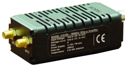
Figure 1, Model A10150